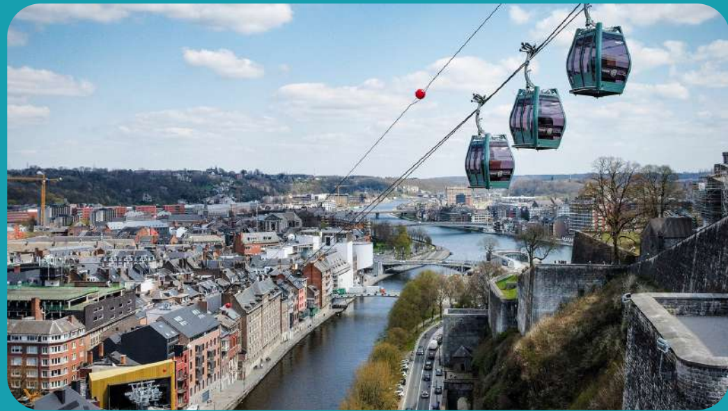
Namur's cable car