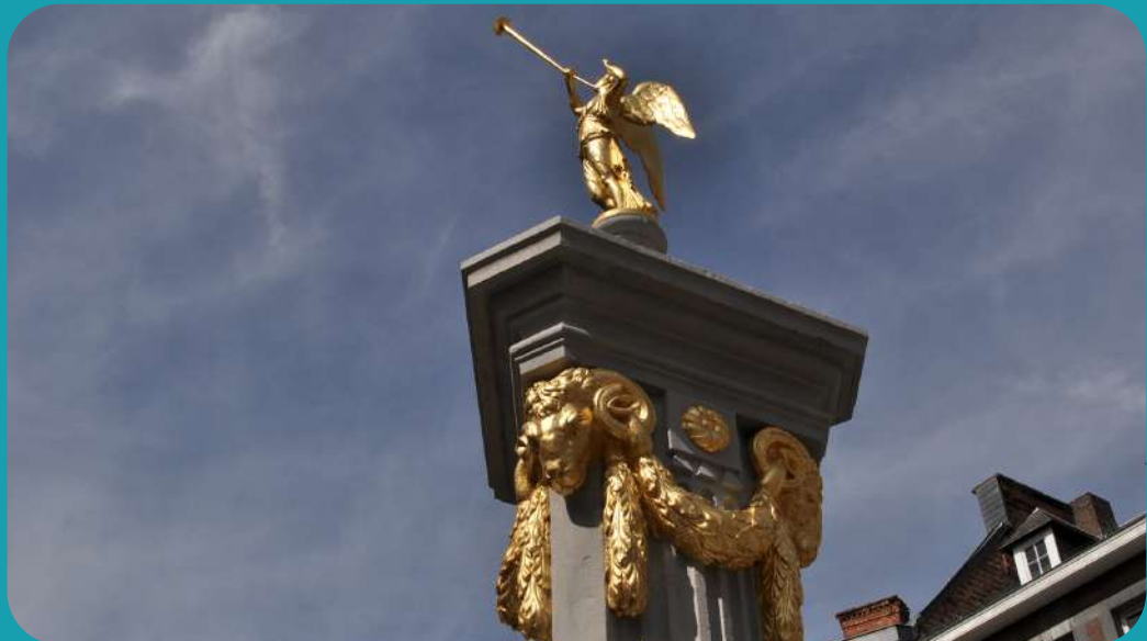
Statue of the angel