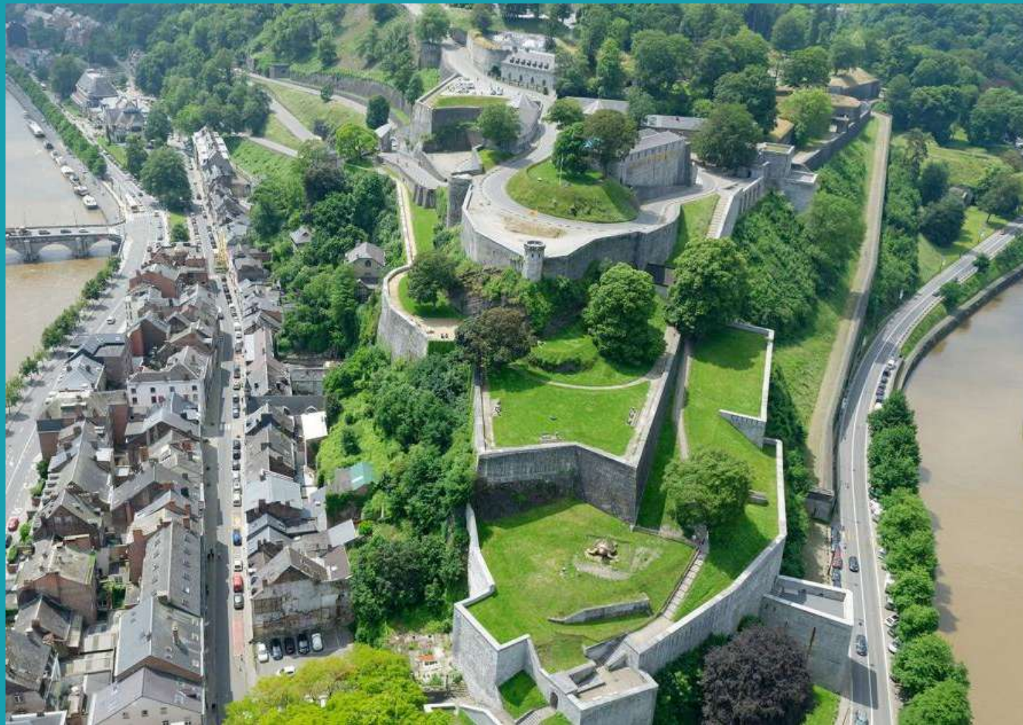
Citadel of Namur

Visiting Namur means strolling through the pedestrian area without hurrying, enjoying a beer on the vegetable market square or walking to the Citadel. From the top of this spur, sheltered by one of the largest fortresses in Europe, the view of the old city is incomparable.