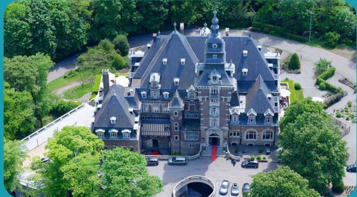
Castle of Namur