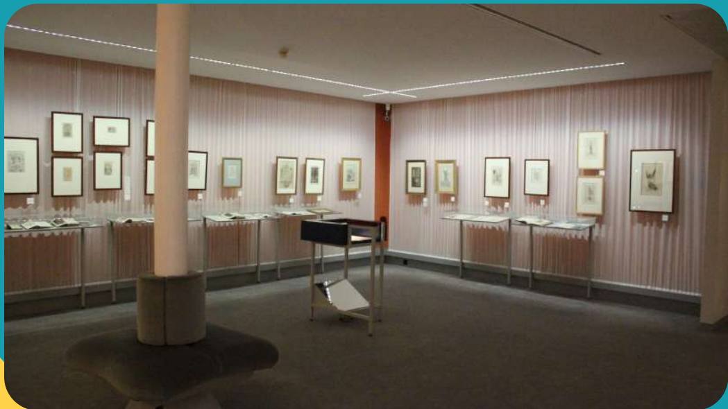
Félicien Rops museum