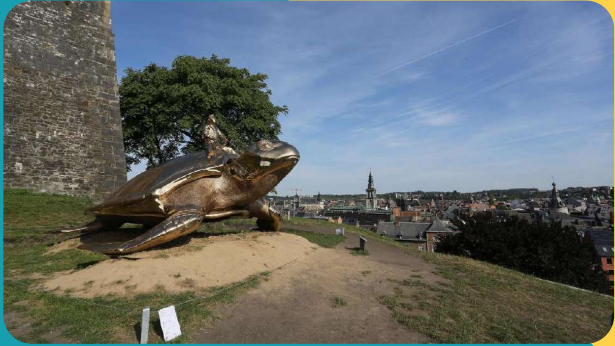
"Searching for Utopia"

The city offers a multitude of activities, both cultural and sporting, giving you the opportunity to explore the city to its fullest extent in your free time.